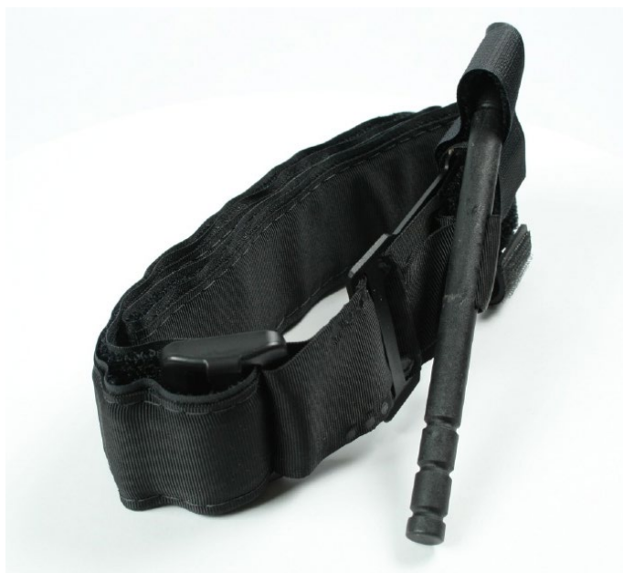
Figure 1: Combat Application Tourniquet